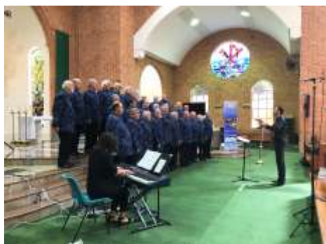
Sydney Male Choir Sunday 29 September 2019

About 90 people came to the concert and a lovely time was had by all with the Sydney Male Choir bringing some fun to the occasion and a fine afternoon tea enjoyed in the garden.